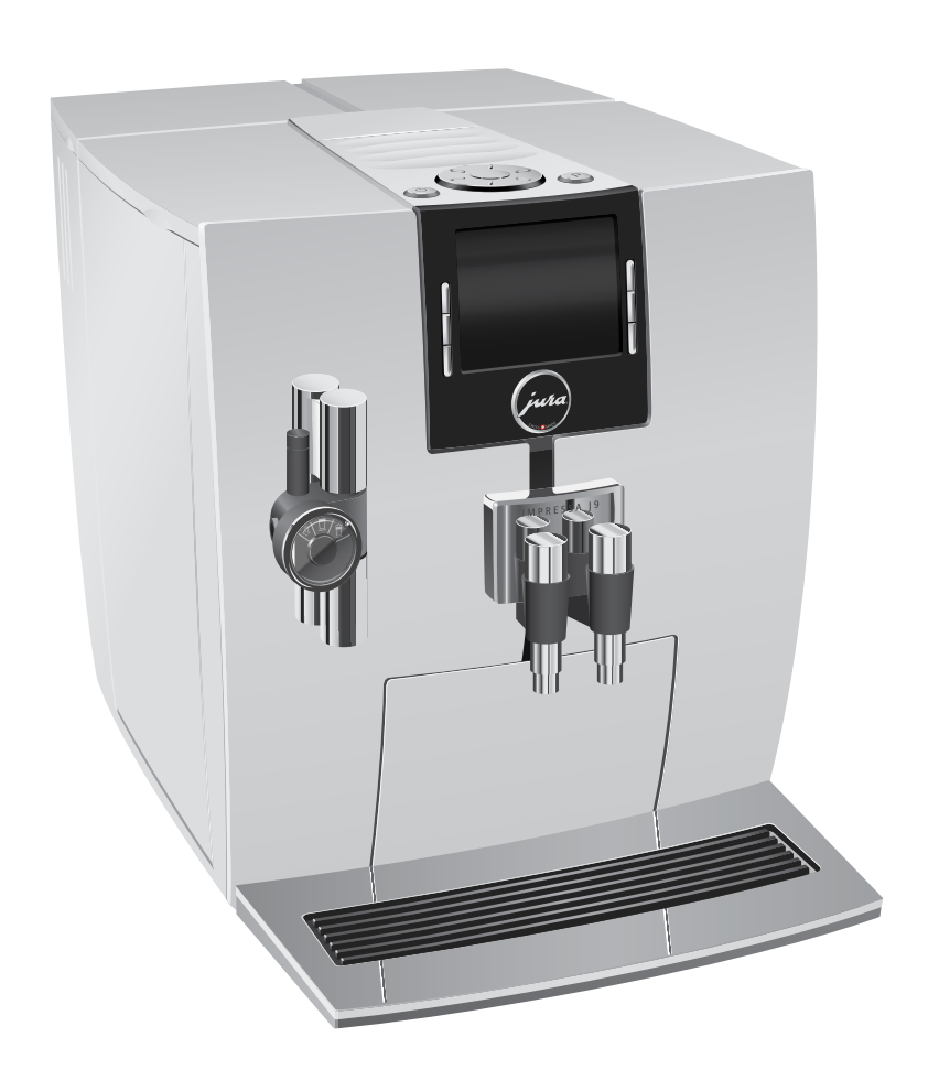
IMPRESSA J9.3 – Quick Reference Guide